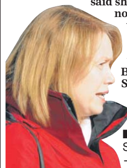
■ Mrs Smith – no rise

Angela Smith, Labour MP for Basildon and East Thurrock, said she would not be taking her rise, while Bob Spink,